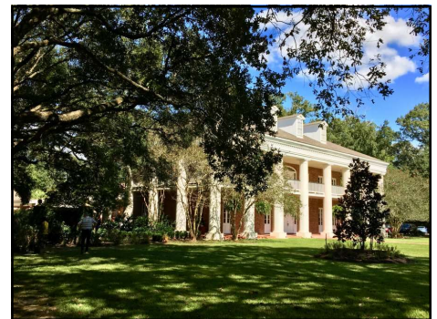
White Oak Estate and Gardens

Many, many thanks to all of our volunteers who made the day possible. Also, much appreciation to Audubon Louisiana for the sponsorship and to Chef Folse and the folks at White Oak Estates and Gardens for their hospitality. All in all, a very successful day and I think people went away with ideas about how they can improve their landscape with birds and wildlife in mind!