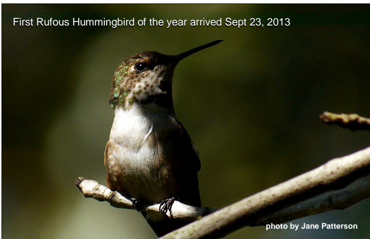
First Rufous Hummingbird of the year arrived Sept 23, 2013