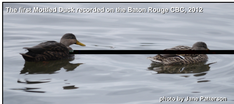
The first Mottled Duck recorded on the Baton Rouge CBC, 2012