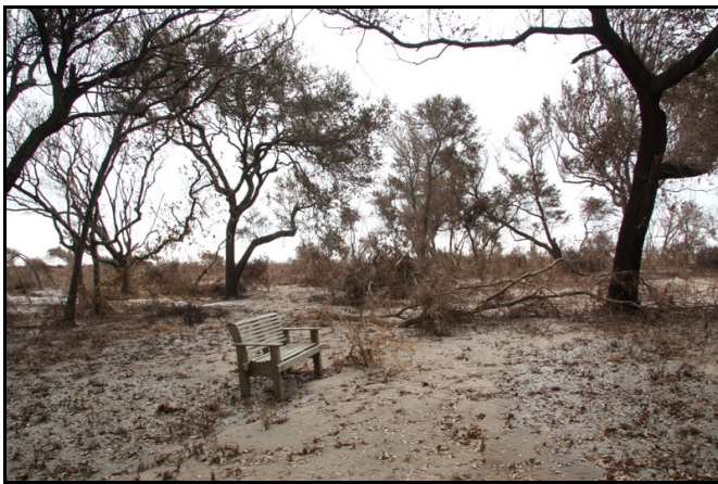
The Leonard East Memorial bench has now survived both Hurricanes Rita and Ike

I agreed to take a turn with the responsibilities starting last May. The summer consisted of working with the grass cutting and helping the winter plantings through their first summer. Plans for a pond were in the works and I was hoping to have something for the fall migrants. However, Hurricane Ike brought a 12 foot storm surge along with high winds into Cameron Parish. The salt water washed over Peveto Woods